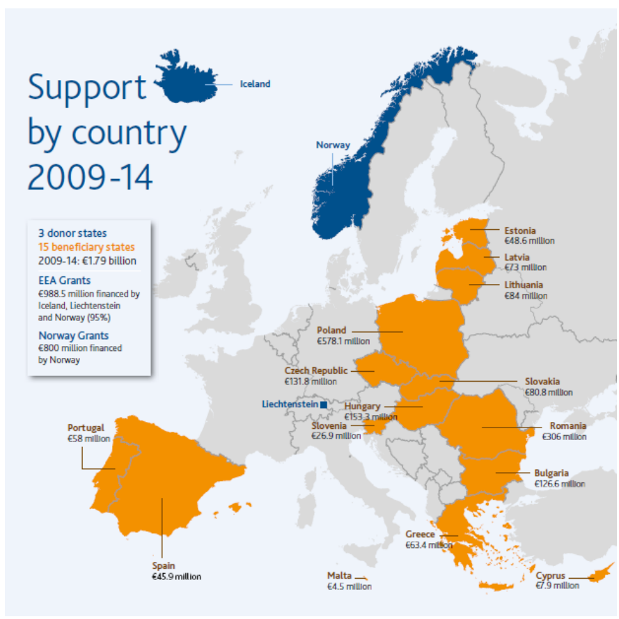
Figure 3 Nordplus Programme | Information on support by countries

The Nordplus Programme is aimed at institutions and organisations in the participating countries that focus mainly on education and lifelong learning. Individuals may not apply for grants directly from Nordplus, but they may take part in activities organised by an organisation or institution.